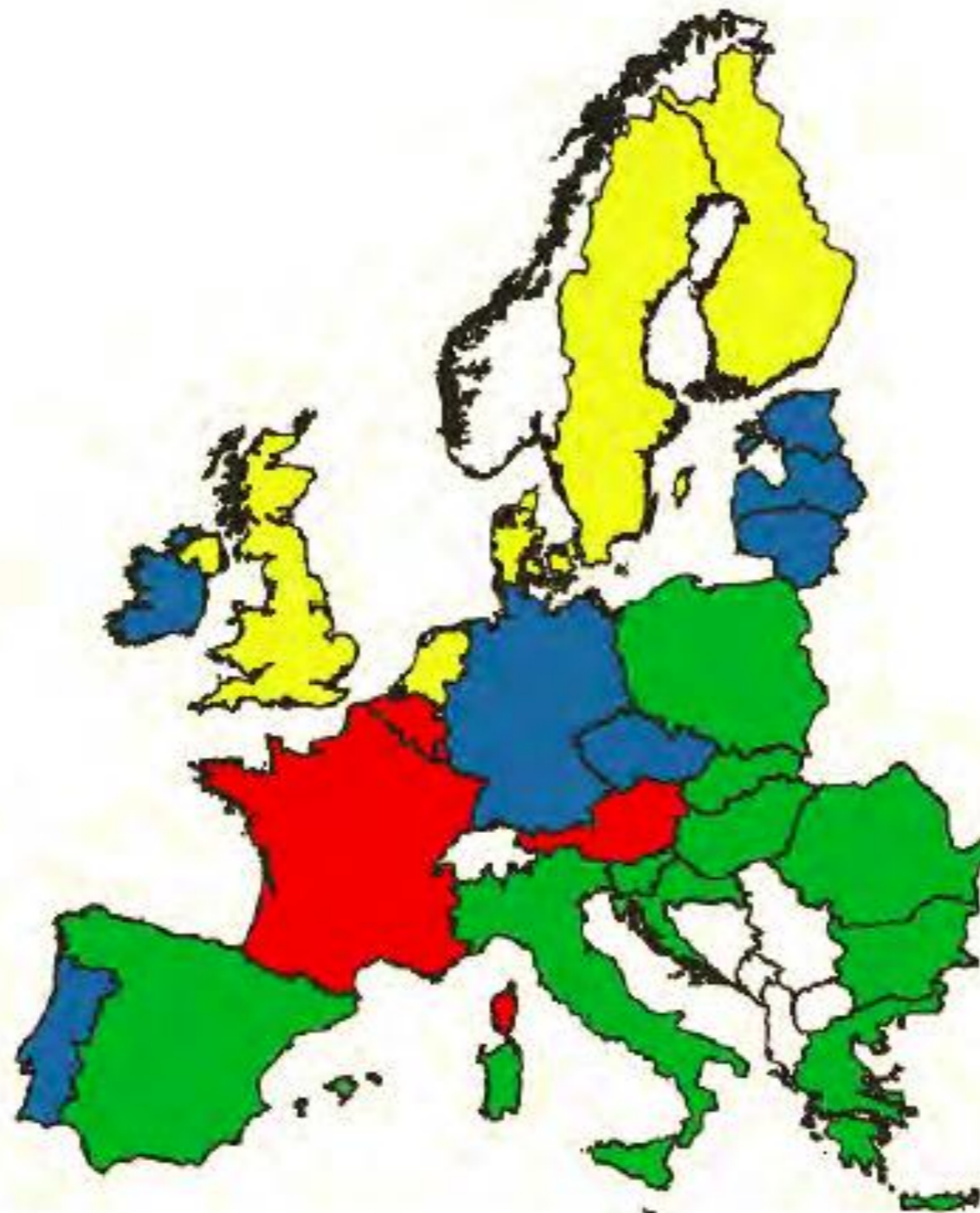
Figure 3: Map of country clusters